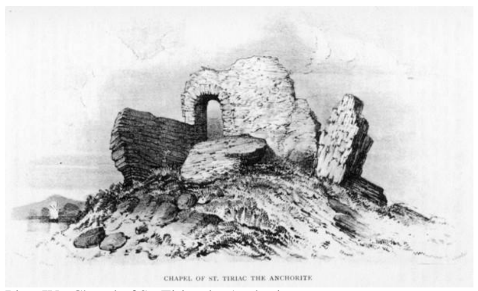
Plate IV: Chapel of St. Tiriac the Anchorite