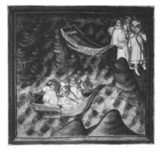
THE YOUAGE TO BEFAYE