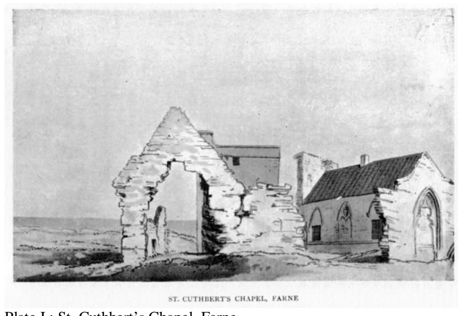
Plate I: St. Cuthbert's Chapel, Farne