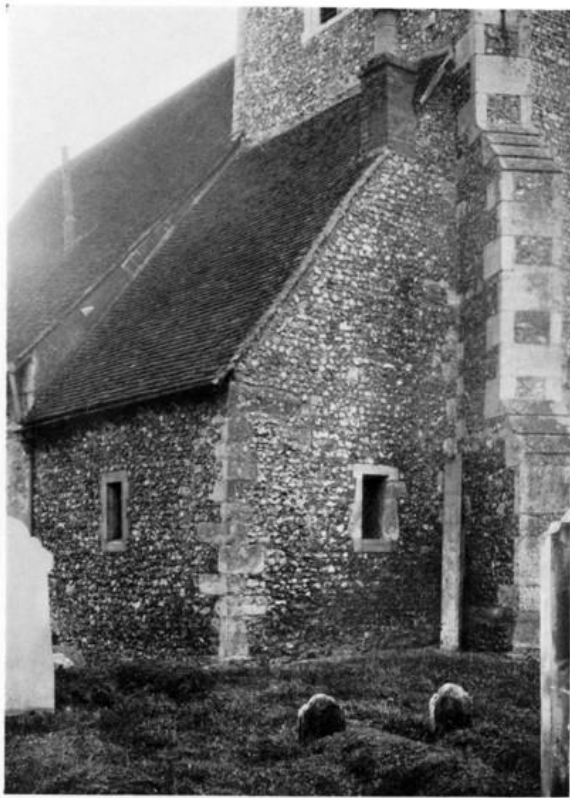
ANCHORAGE AT HARTLIP