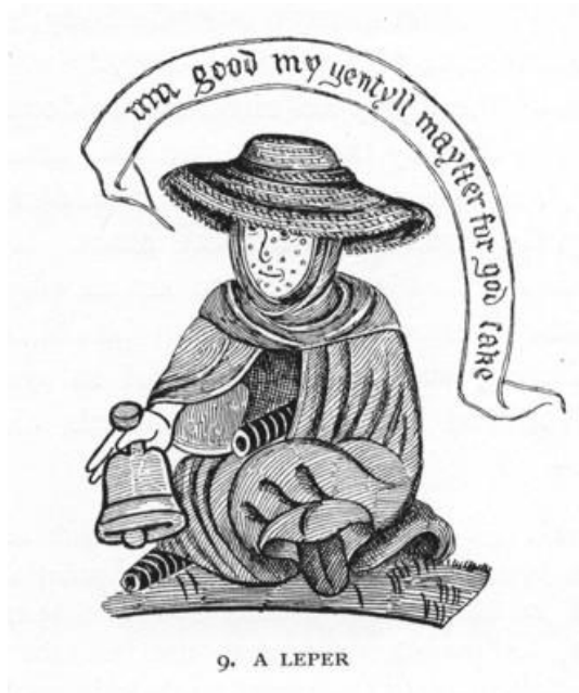
[Illustration: A Leper.]

murmur against God, but rather to praise and glorify Him who was led to death as a leper.”