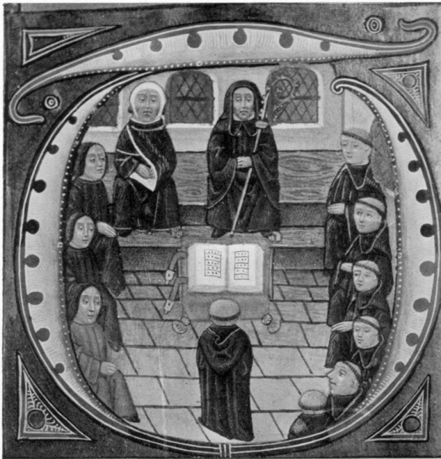
COMMUNITY IN CHAPTER HOUSE, WESTMINSTER

Illustration: Community in Chapter House, Westminster