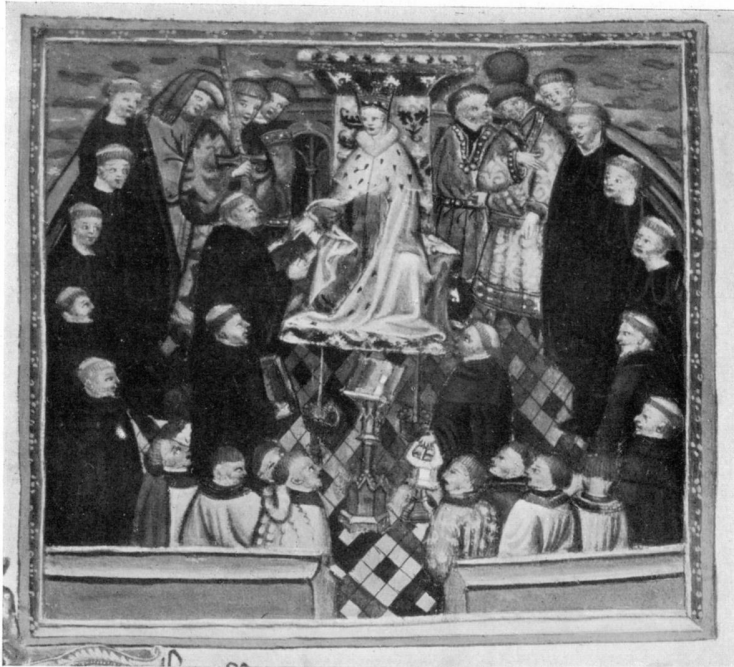
HENRY VI BEING RECEIVED AS A CONFRATER AT EDMUNDSBURY

Illustration: Henry VI Being received as a confrater at Edmundsbury